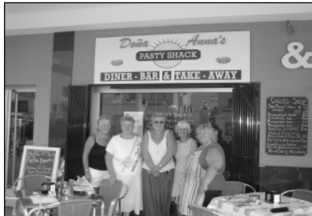
LOCAL ARTISTS EXHIBITION