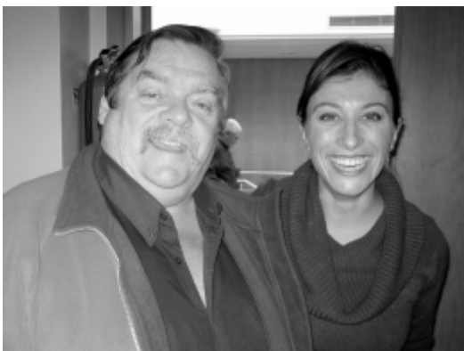
Miss Mónica Lorente, Mayor of Orihuela, with 'yours truly', who she referred to as 'Hombre grande' - cheeky!