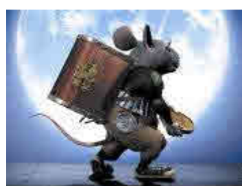
Two views of Ratoncito Pérez