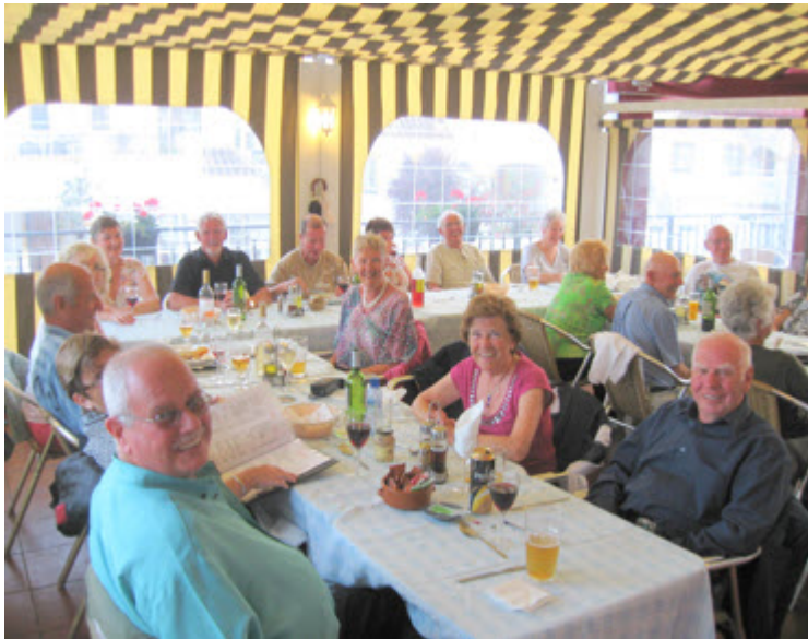
Part of the Petanca Club party at Galadriel's.