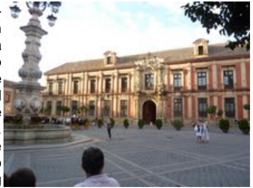
Cathedral Plaza, Sevilla

Seville is a mere 87 km from Cordoba on a fast motorway. We spent 3 nights in a city centre hotel. Again accommodation is varied and plentiful but to get what you want I recommend booking ahead. The old quarter would be the most convenient place to stay as from here many of the main sites are in walking distance. The cathedral of Santa Maria de la Sede is a "must-see" and includes Christopher Columbus's magnificent tomb (although there is some dispute whether or not the remains inside are actually his!). The admission price includes entry to the Giralda (bell tower). The vino tinto and tapas may be worked off by walking up the 34 floors to the viewing platform – alternatively there is an elevator. Either way the views are simply wonderful – just use ear muffs if you're there when the bells strike the hour!! The Real Alcazar, next door to the Cathedral is absolutely stunning – a miniature Alhambra. Having been an Arabic palace in the 10-12th centuries, it became the official residence of the Christian kings in 1248. They rather liked the splendid design and preserved and enhanced the buildings in Moorish style. It remains a Royal Residence and King Juan Carlos and Queen Sophia use it when visiting Seville.