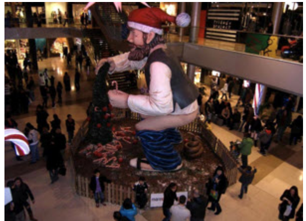
Giant caganer in shopping mall.

The origins of the caganer are a little obscure, but it is thought that they originated in the late 17th - early 18th century. Equally obscure are the explanations for the enigmatic figure - some say it is to do with fertilising the earth, others say that it denotes the equality of man - but it may just have more to do with humour and fun. Although the practice is tolerated by the Catholic Church and the tradition is very popular, many think it is not really appropriate and some belen scenes, even in Cataluña, do not feature the statue. In 2005, when the Barcelona city council commissioned a Nativity scene without a caganer, there was a public outcry and much criticism seeing it as an attack on Catalan traditions. The crapper was reintroduced in the Nativity scene the following year.