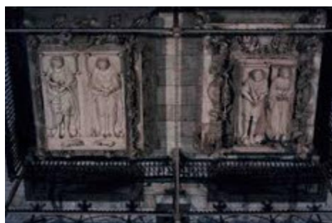
Mausoleum of Isabella & Ferdinand

Other sites well worth seeing in Granada are the Cathedral, which contains the tombs of Queen Isabella and King Ferdinand who defeated the Moors in 1492, the Albacin area and Sacromonte. The Albacin is the old Arab quarter, full of steep, narrow streets of whitewashed houses and Sacromonte is the traditional home to the Andalucían “Gitanos”.