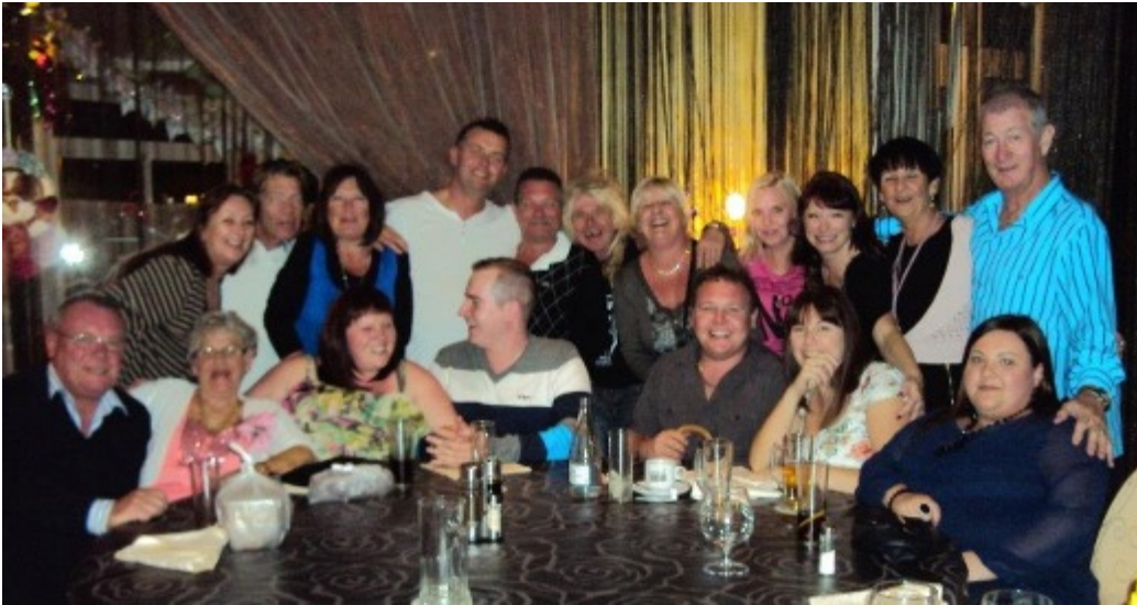
This happy bunch on the left is the Lime Bar Christmas Party.

Below, some images from the Lime Bar New Year's Eve Fancy Dress Party.