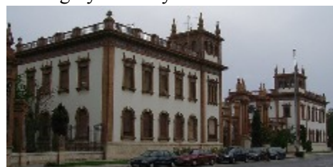
photo) was converted at a cost of €40 million - €17 million more than the original budget! - but even now the museum lacks security doors and CC TV's. Admission is free.....if you feel like driving down! Mayor Francisco, not one to shy away from turning a financial disaster into a calamity is now toying with the idea of a museum of museums!

Idiot of the Month Award goes to the Mayor of Málaga, the PP's Francisco de la Torre. Francisco it seems, is stuck on the idea that museums are key to attracting more visitors to the city. Yes, I can just imagine the golfers and piss-heads queuing up for these. So to date, the city has a Museum for the Holy Week Brotherhoods, for cars, for wine, for glass, and even for dolls. Then Francisco decided to have a museum of gems called the Art Natura Gems Museum and contracted a firm, Royal Collections, to provide the gems and management. Royal Collections expected the museum to open in 2008, and when the work was still not completed in March 2011, the gem company asked for the contract to be cancelled; but this was rejected by the courts and an ultimatum was issued to the company to open the new museum. So the gem museum opened on Jan 18, but there are no gems or anything on display and it is highly unlikely that there will ever be any. An old tobacco factory (see