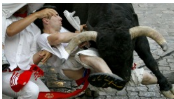
'What a tangle!'