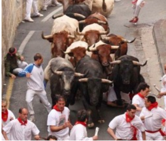
'Here come the boys!'

It also covers future months as well and is a good reference site. July also sees the Fiesta San Fermin with its famous bull run, which takes place from July 6 to July 14. The following photos were taken at previous runs.