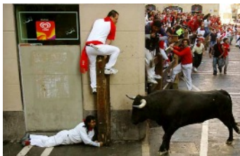
'I can wait all day!'