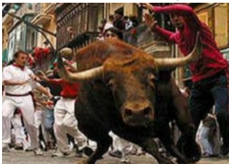
'Say "Hello" to my little friends!'