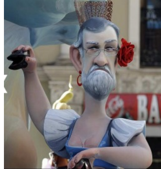
Top left shows Merkel with Rajoy and others making cuts. On the left Queen Sofia and King Juan Carlos next to PM Rajoy 'tarted-up' as a flamenco dancer.