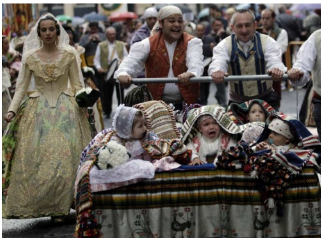
Note the crying-baby bottom left and the child with the 'dummy' in her mouth, bottom right!