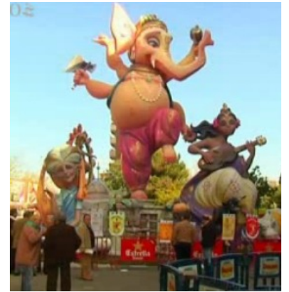
The above falla was saved from burning at the request of the Hindu community and donated to them.

The Falles (or Fallas ) is a five-day continuous fiesta held annually in the city of Valencia, in honour of St. Joseph. Most neighbourhoods in the city construct ninots of firecracker-filled cardboard and paper-mâché creations which make up the falla display. These fallas are always very witty, satirical and topical. But, at the end of the fiesta, they are all burned except for one prize-winning display. This year around €8 millions' worth - 800 large ninots - went up in smoke!