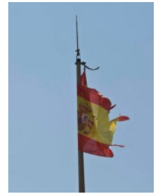
Parts of Alicante Castle, Castillo de Santa Barbara, are in a very sorry state. It seems that the upkeep of this historic location has been neglected for many years. The above photos were taken by Informacion in August, during the height of the tourist season. (Note the medieval microwave dishes on the far left!)

Below is a photo from Informacion which shows the aftermath of a botellón in Campoamor in early August. Around 20,000 youths attended the party and the Orihuela council workers picked up 55 tons of rubbish at a cost of €8,500.