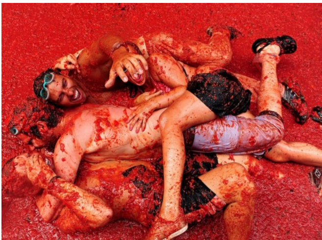
This year's Tomatina was held in Buñol on August 28. For the first time it was decided to limit the numbers by charging €10 to each of the 20,000 revelers.