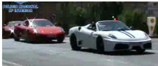
National Police agents have dismantled two workshops where mid-range cars were transformed into look-alike luxury car brands such as Ferrari and Aston Martin . The cars were on sale through two websites for a price that was about €40,000, compared to the €200,000 a real one can cost. In some instances the cars were made to order. sometimes were made prior request. Eight of the engineers were arrested, five in Valencia and three in Madrid. A total of 19 vehicles were seized, 17 'Ferraris' and two imitation Aston Martins. I have seen a video of the interior and engines of these cars and they looked terrific. Just the thing to impress the ladies in the local bar.....or down the roundabout! It is a great pity that the undoubted creative talent of these 'replicators' could not be put to better and legal use.