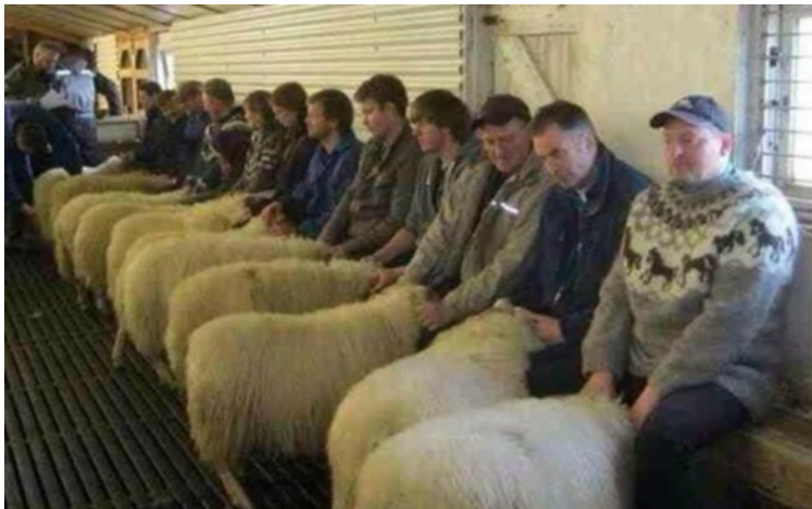
Speed dating in New Zealand.....and possibly Wales.

Apologies to the history buffs! As we have had two separate family groups visiting us during the past two weeks, I have been unable to devote the necessary time to this month's history article. This is a particularly important one as it deals with the polarisation during Spain's Second Republic and the contributing causes of the Spanish Civil War; certainly not one to be rushed. See it next month.